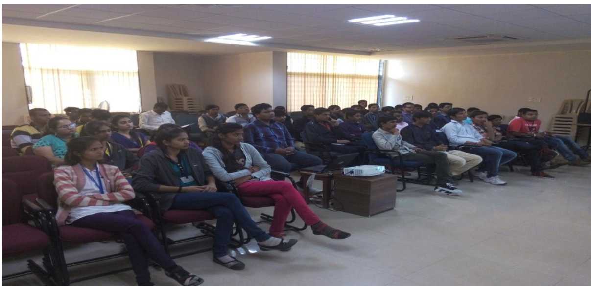
At BISAG Presentation Hall