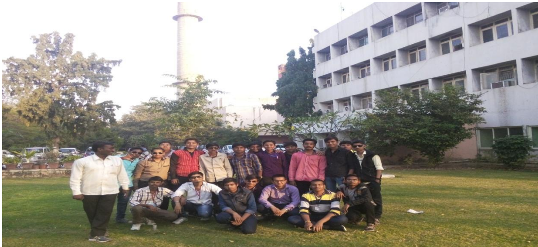
At Doordarshan Kendra Campus